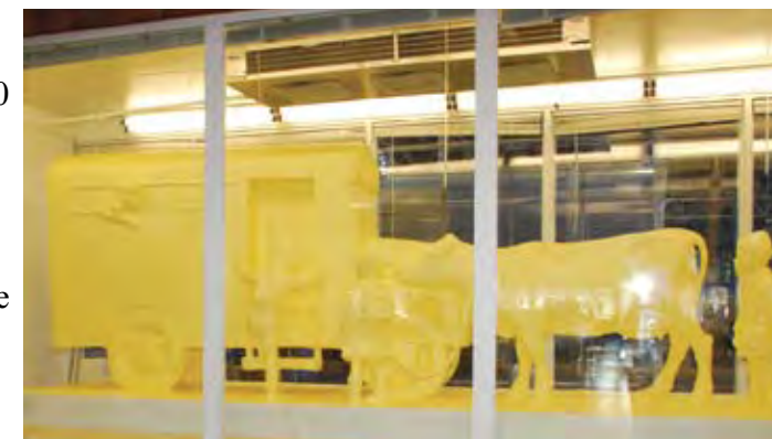
The 17th annual butter sculpture focused on dairy education.

High School. At Penn State, the butter sculpture will power the tractors used to harvest crops. At State College High School, it will