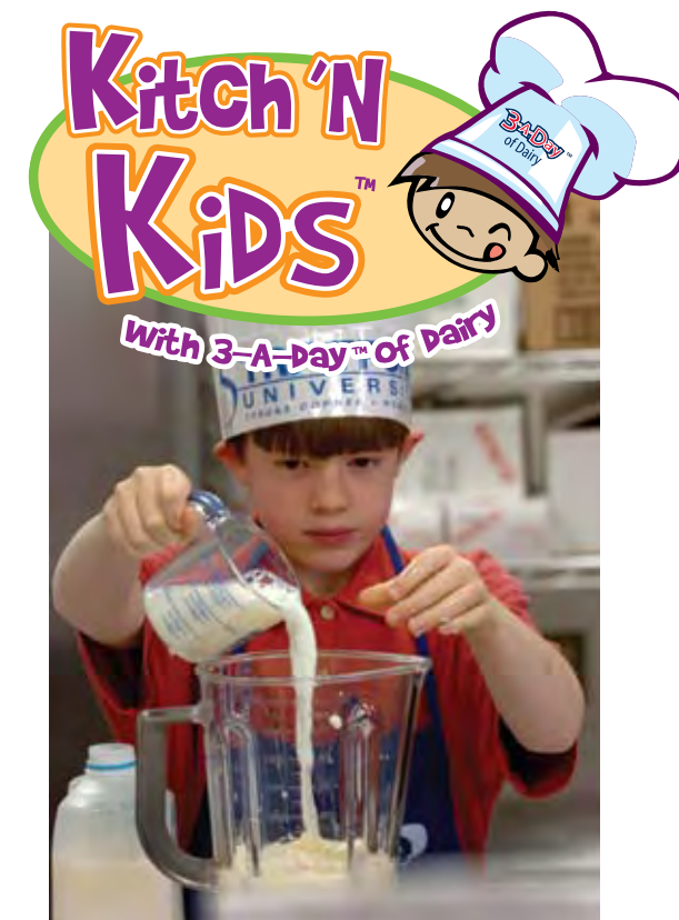
A young chef prepares an orange vanilla smoothie, made with lowfat milk and nonfat yogurt.